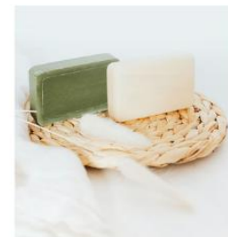
HANDMADE - SOAP